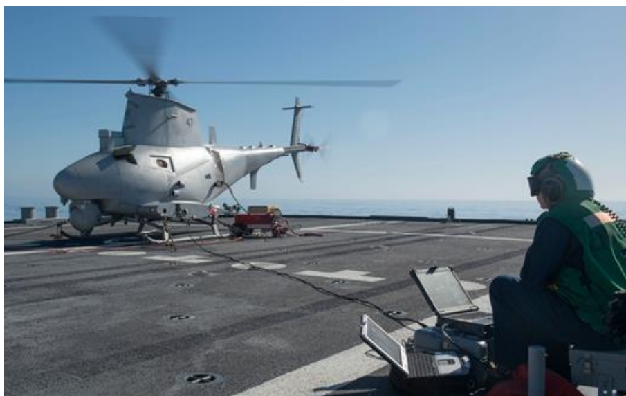
Figure 6. Northrop Grumman MQ-8B Navy Fire Scout. [17]

The deployment of UAVs makes it possible to receive HD aerial images within seconds upon their return to base. Recorded images are available to the professionals in a very short period of time. “A micro size UAV was deployed first in Hungary to recon fire in the city of Szendő in 2006. It was also the first time on the globe when such equipment was deployed to execute such task.” [16] With the continuous transmission of images taken in the area of the accident further expansion of the fire can be preventable. Aerial images can greatly support the damage assessment work and great time-saving can be also achieved because the affected area does not have to be patrolled on foot.