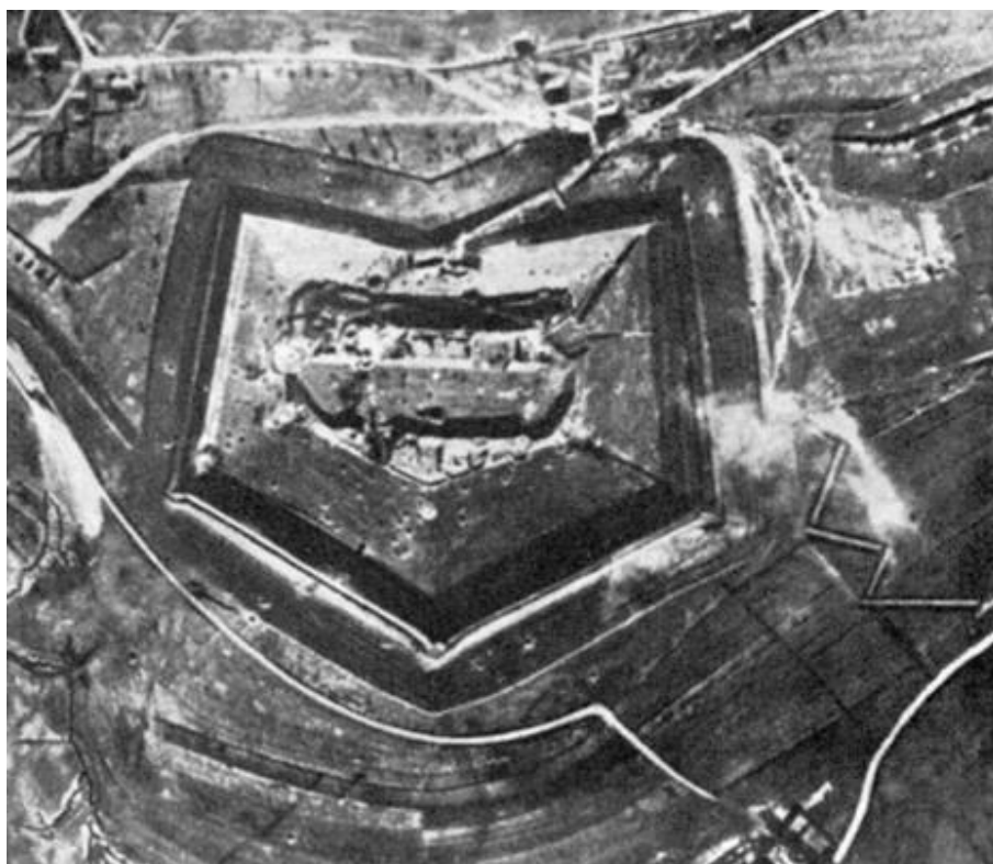
Figure 1. Fort Douaumont just before the battle [2]

The history of aerial reconnaissance goes back to the age of Napoleon. Contemporary balloons were used to survey the manoeuvres of enemy forces. The first aerial bombing took place just before the First World War during the Turkish – Italian war. In those days aircrafts were not really useful as a strike force, mainly because of their power and the lack of their appropriate arsenal. On the other hand, they were perfect to execute reconnaissance missions and to control artillery fire.