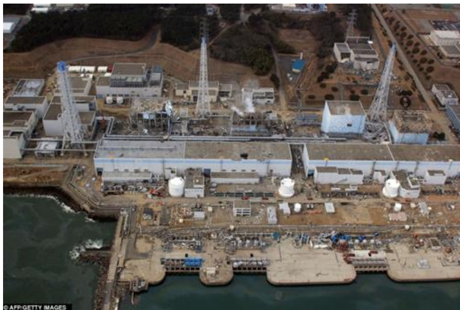
Figure 4. Fukushima nuclear power plant [10]

catastrophe abatement. On the other hand, pre-planned reconnaissance flights were executed above the contaminated area. Additionally, UAVs can be applied preventively to monitor the area of a nuclear power plant and to scan the level of contamination right after the occurrence of a possible catastrophe. During the preventive period, activities like monitoring and radiation measuring can be executed. By applying this scenario higher than normal radiation can be easily observed. Right after the potential catastrophe UAVs can be deployed rapidly and accurately to collect information on the area of the contaminated surface. Drones can provide useful information on the additional risk factors and on the possible routes of the contamination. By receiving these crucial information professionals in charge of the rescue may be able to plan the following task and they can estimate the possible risk factors. It also has to be highlighted that aerial reconnaissance executed by a UAV in the contaminated area may replace those radiation detectors that are controlled by a flight crew and applied on conventional aerial vehicles. Therefore, UAVs can save the life and the health of the participating personnel. HD 4 pictures of the Fukushima power plant shown on Figure 4 were taken by the Japanese Air Photo Service on 24 Mar 2011 just a bit after the occurrence of the catastrophe.